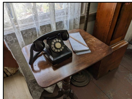
And a telephone, ubiquitous by the 1940s.

Founded in 1974, Connecticut Humanities (CTH) is an independent, non-profit affiliate of the National Endowment for the Humanities. CTH connects people to the humanities through grants, partnerships, and collaborative programs. CTH projects, administration, and program development are supported by state and federal matching funds, community foundations, and gifts from private sources.