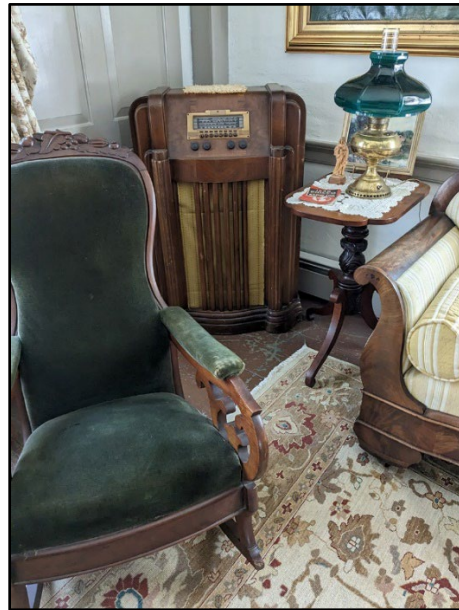
Radio in an 18 th century house? Essential in a World War II scenario.

The Lester House opened for the season on Memorial Day, May 29 th . The "Fog of War" exhibit will remain in place until July 4 th , open to the public during regular weekend hours, Saturday and Sunday, 1:00 - 4:30 PM or by appointment. 153 Vinegar Hill Rd. Gales Ferry, CT 06335